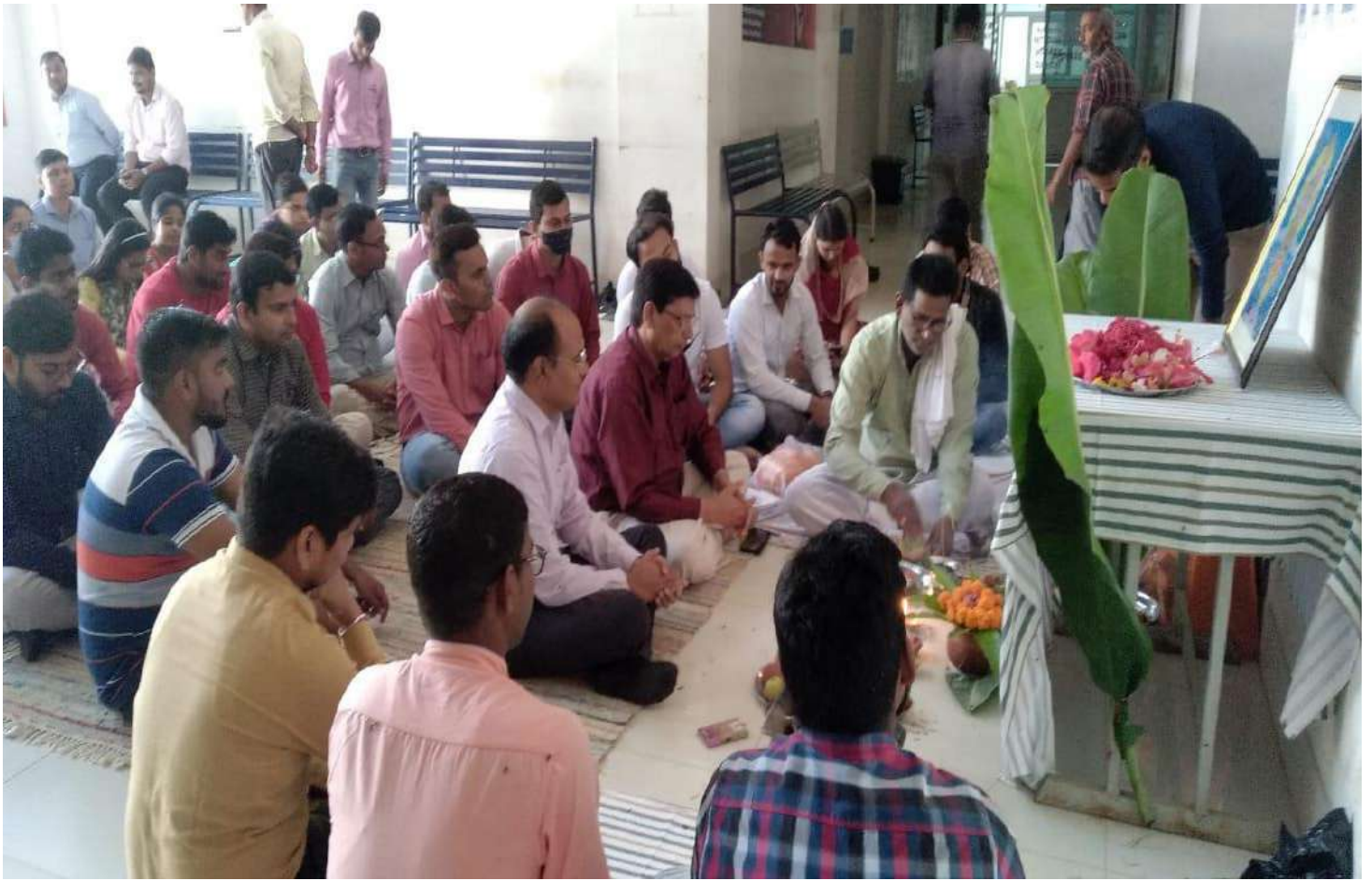
Dhanwantari Pooja on – Ayurveda day – 02 November, 2021