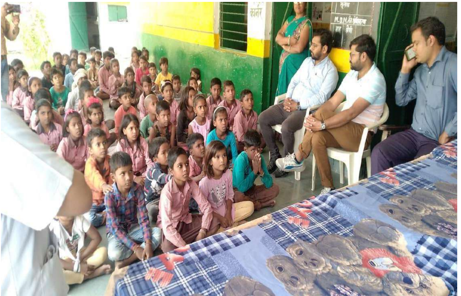
Bala Swasthya Rakshan Program in Sonaur, Rajgar, Mirzapur – Primary School