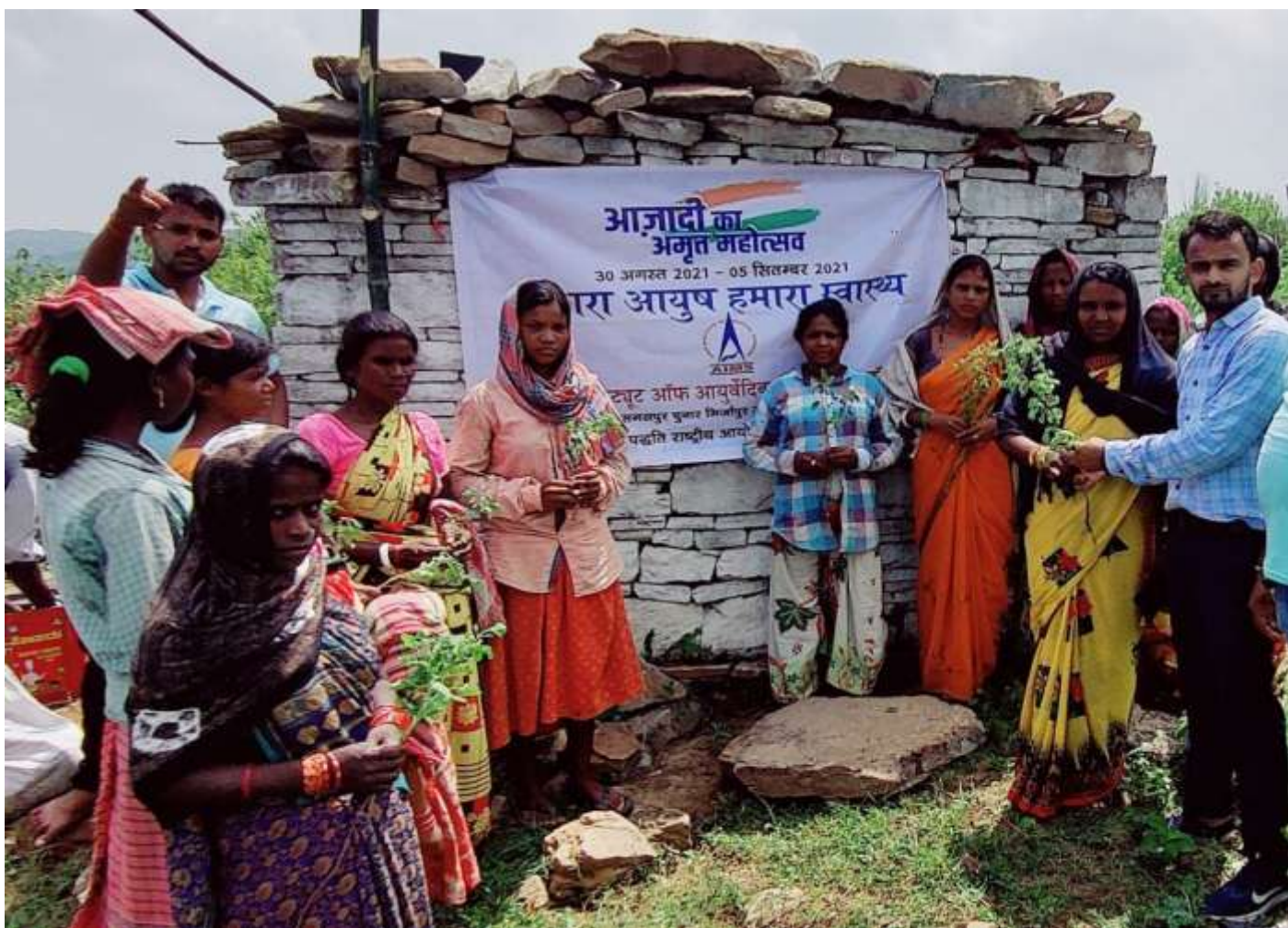
Distribution of Tulsi Plant and Describe about their benefit – 30-08-2021