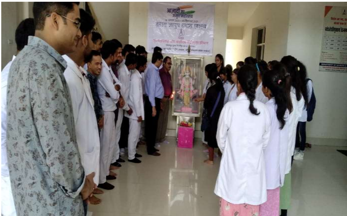
Inauguration of Azadi ka Amrit Mahotsav “ HAMAARA AYUSH HAMAARA SWASTHYA”