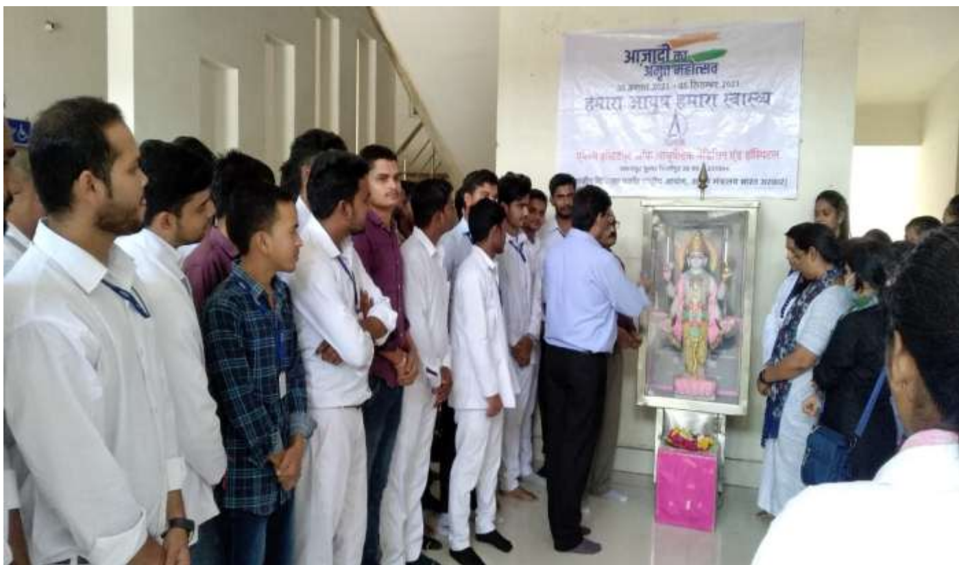
Inauguration of Azadi ka Amrit Mahotsav “ HAMAARA AYUSH HAMAARA SWASTHYA”