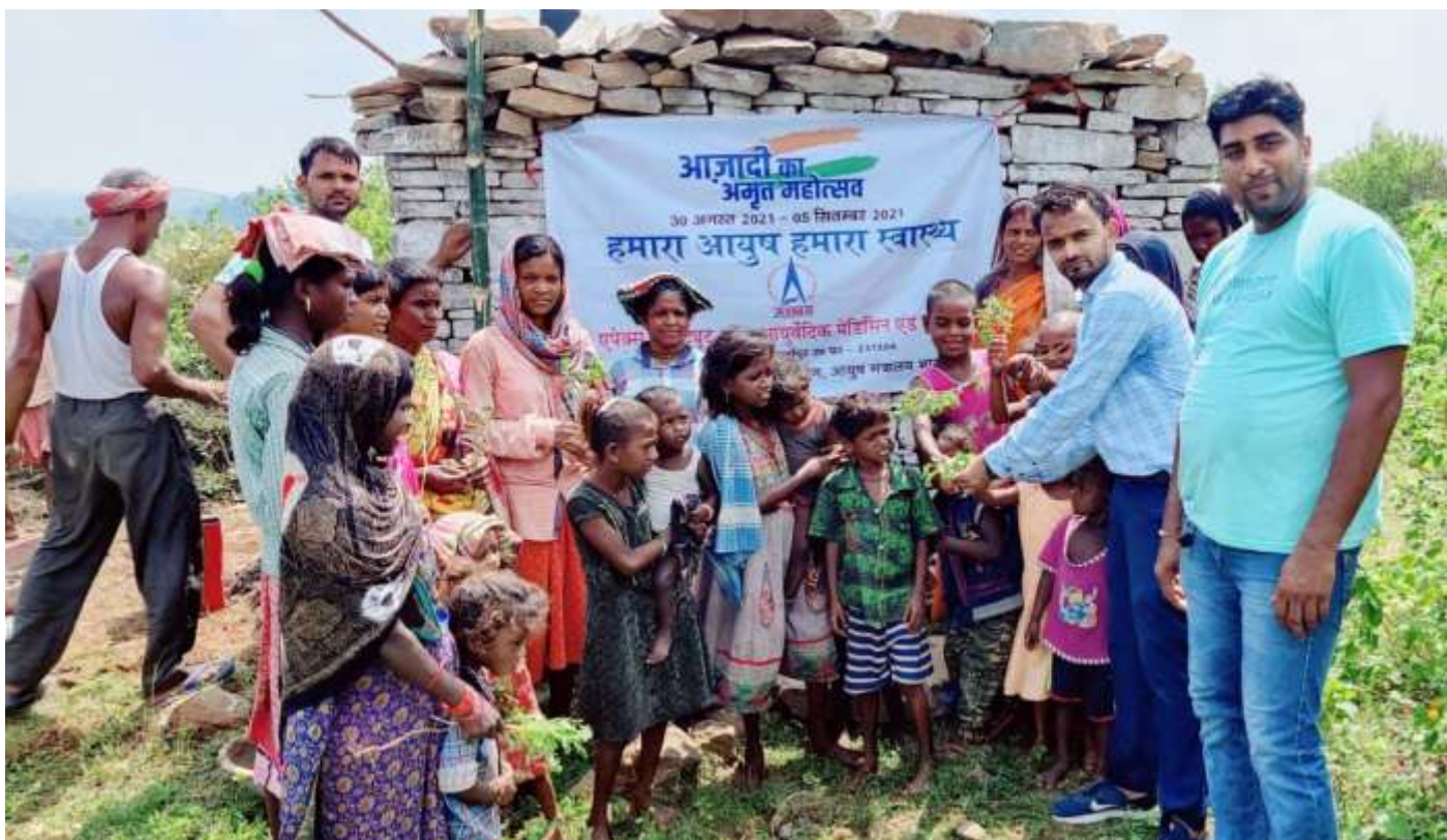
Distribution of Tulsi Plant and Describe about their benefit – 30-08-2021